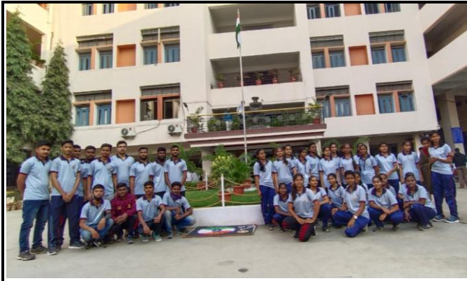
Police Bharti Batch Students