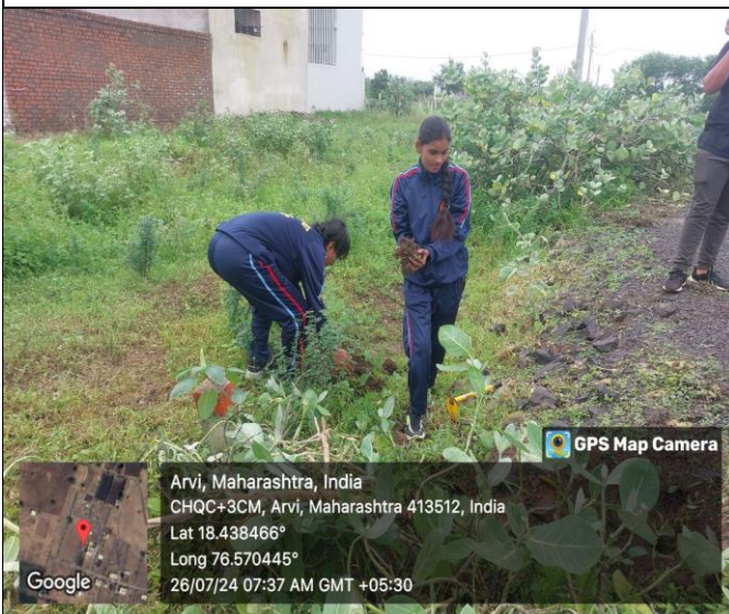
Cadets while preparing land for plating tree