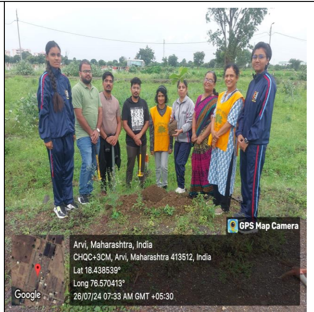
Teachers and Cadets while planting tree