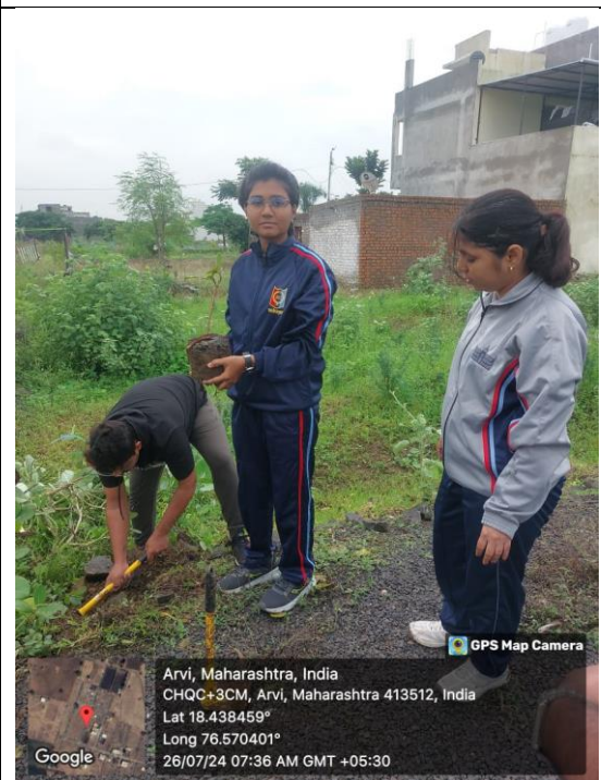
Teachers and Cadet while planting tree