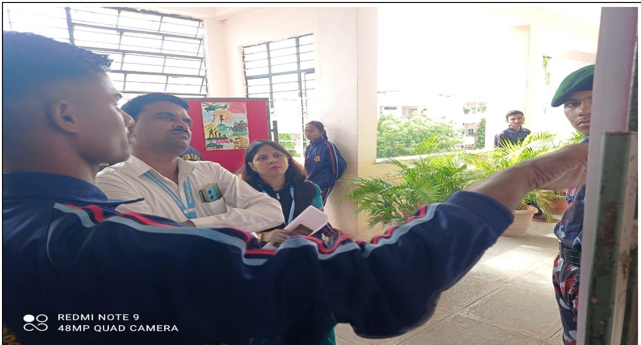
Cadets while presenting Posters