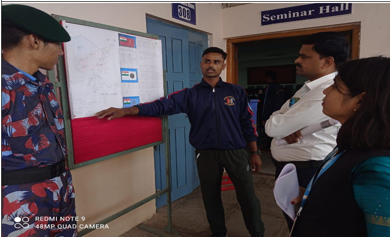
Cadets while presenting Posters