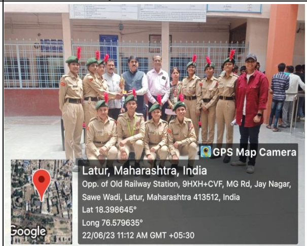
All Dignitaries with "B" & "C" Certificate Qualified Cadets