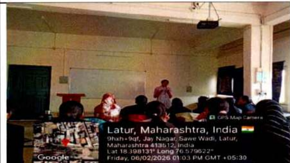
12 th Lecture Date 06/02/2026