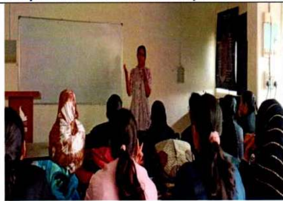
1st Lecture- Date 05/01/2026