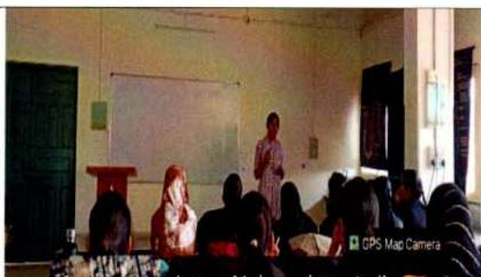
30 th Lecture Date 27/03/2026