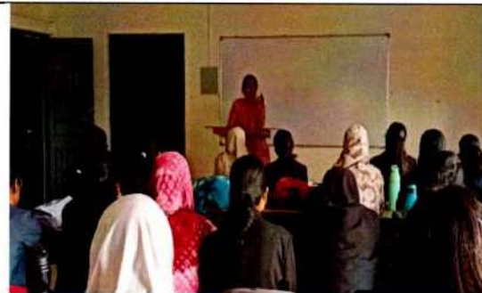
24 th Lecture Date 10/03/2026