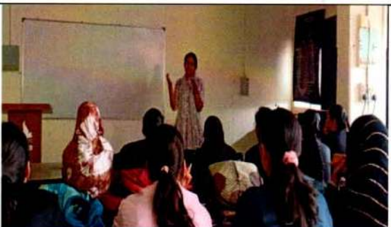
25 th Lecture Date 11/03/2026