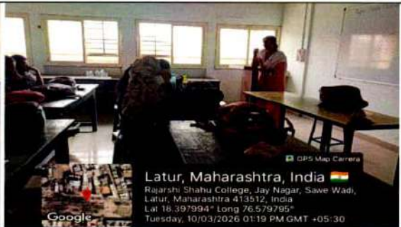
24 th Lecture Date 10/03/2026