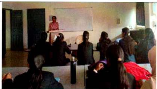
28 th Lecture Date 23/03/2026