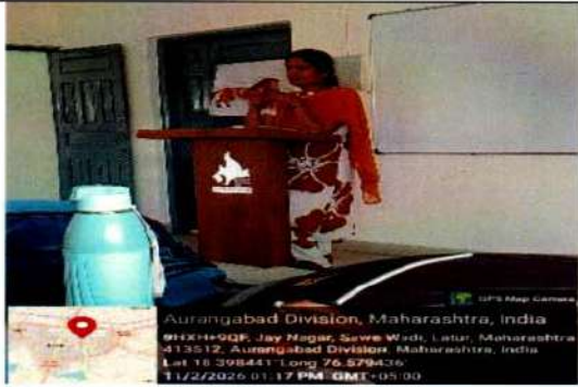
14 th Lecture Date 11/02/2026