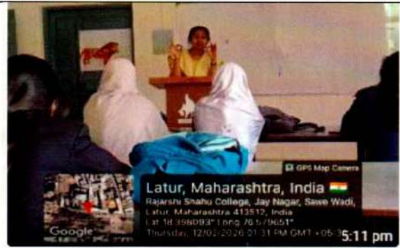
15 th Lecture Date 12/02/2026