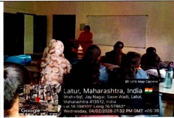
10 th Lecture- Date 04/02/2026