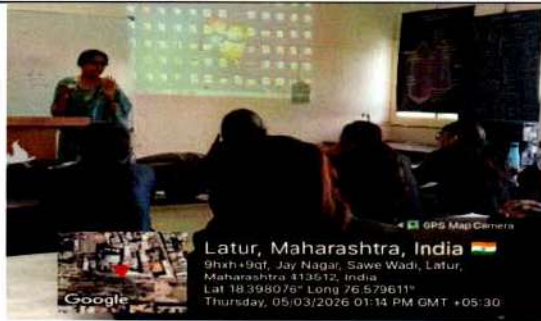
21 st Lecture Date 05/03/2026