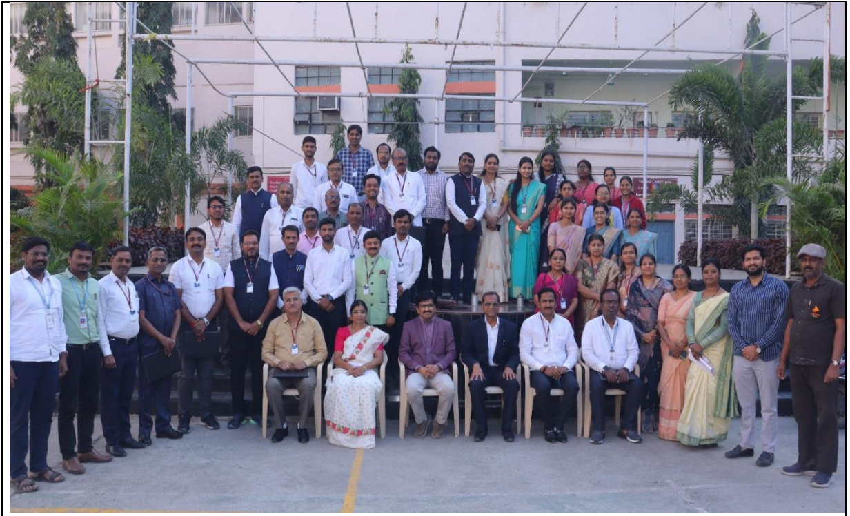
Together towards digital excellence: FDP participants on e-Contents Development & MOOCs.