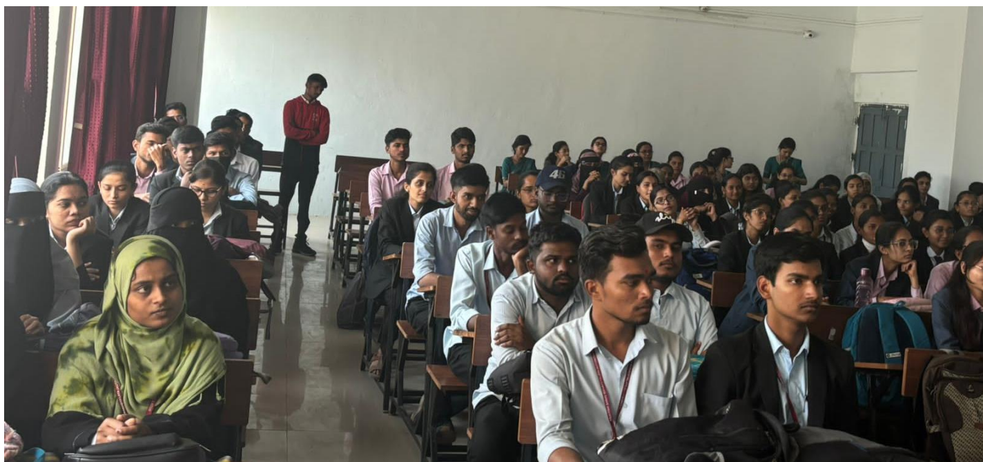
Participants of One Day Workshop on “Strategies to Crackdown Competitive Examination in Life Science”