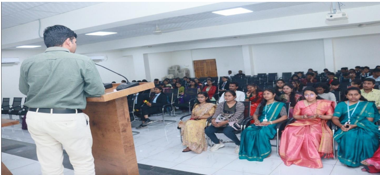
Participants of Inauguration and Welcome Function