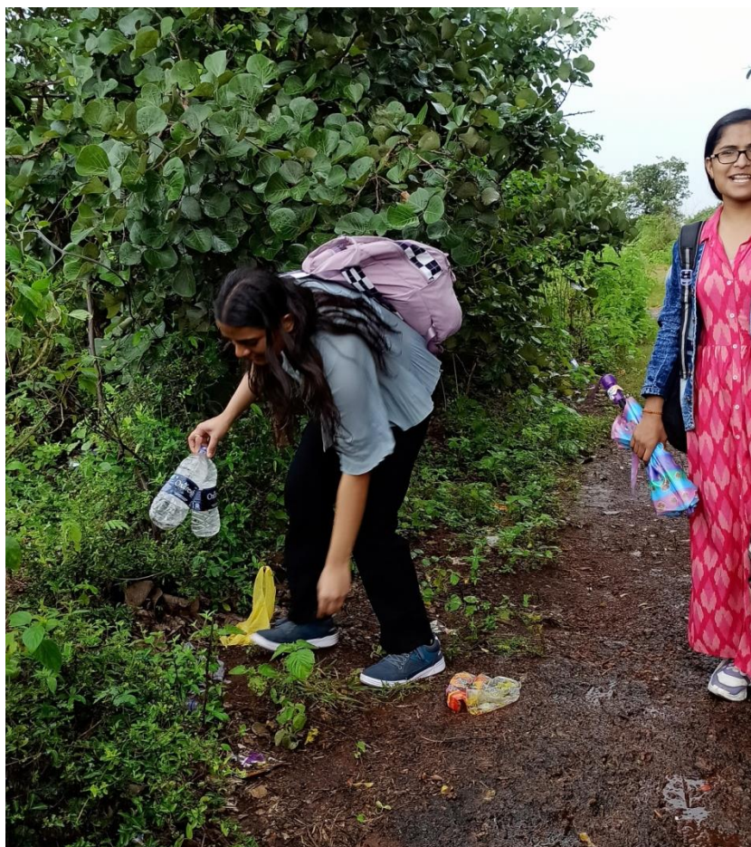
Students during collection of Plastic waste at Sanjeevani Bet, Wadwal (Nagnath)