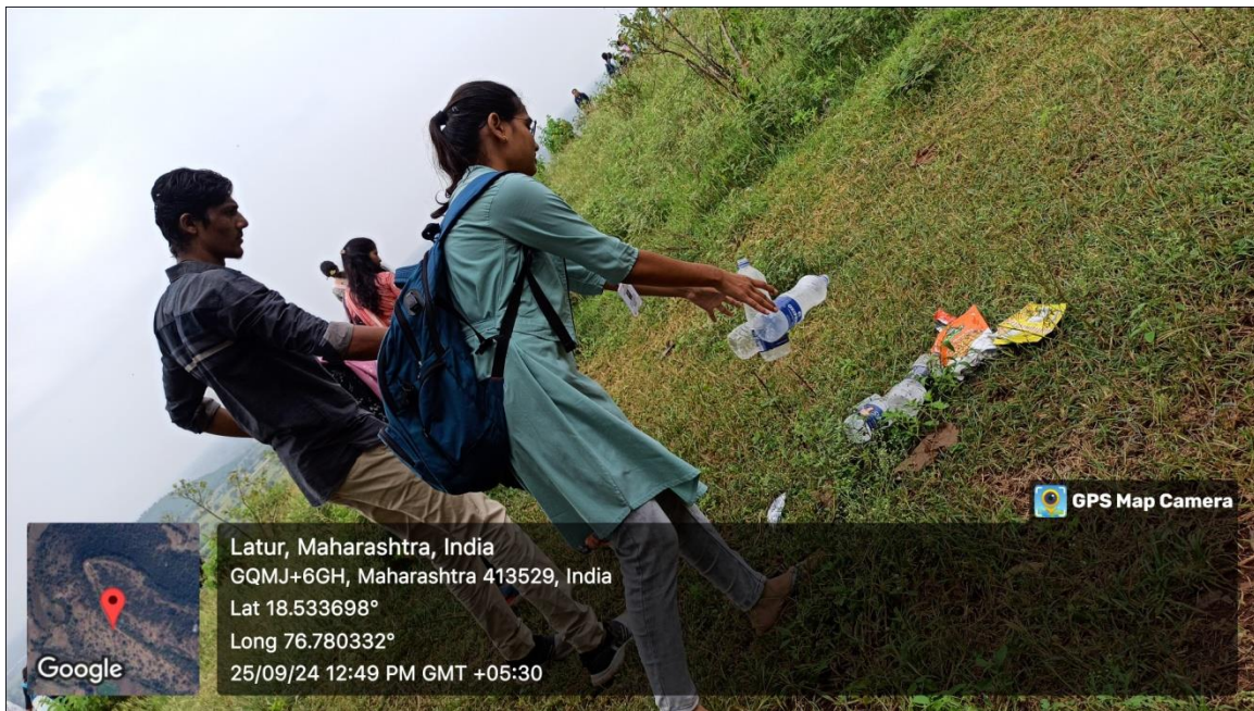
Students during plastic collection and eradication at Sanjeevani Bet, Wadwal (Nagnath)