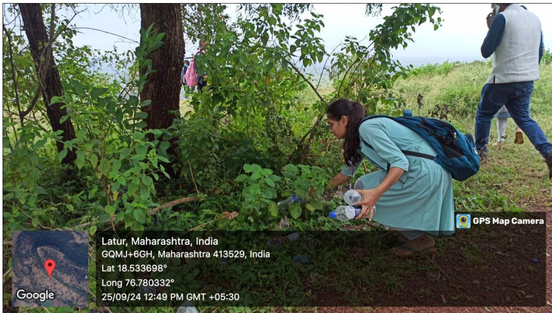
Students during collection of Plastic waste at Sanjeevani Bet, Wadwal (Nagnath)