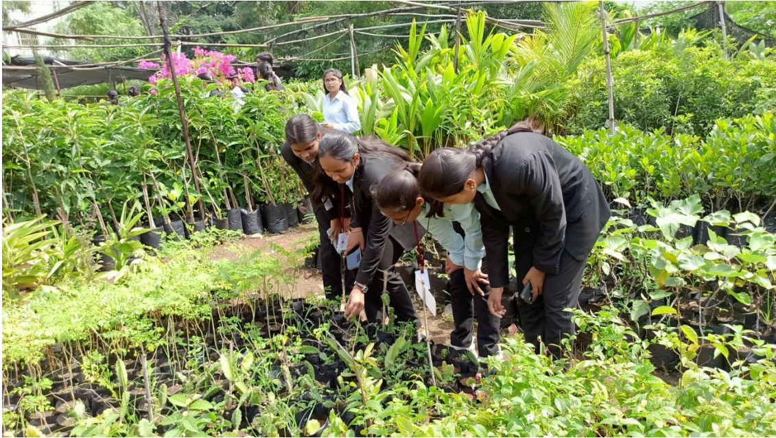
Students while observing the Nursery plants.