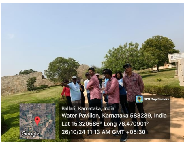
Guide while explaining flora of structure of Octagonal Water Pavilion to students.