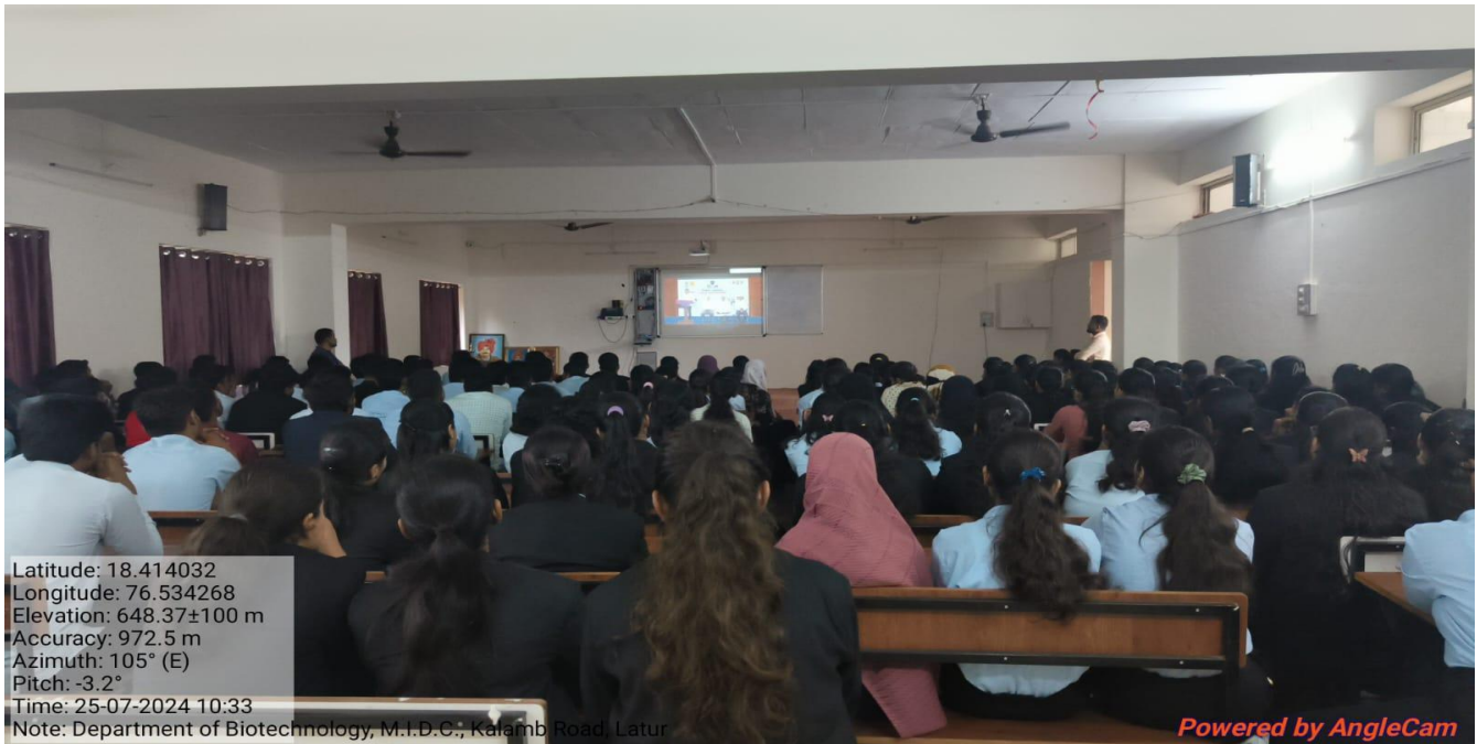
Student participants attending the program webinar on education for all and enrichment of Maharashtra