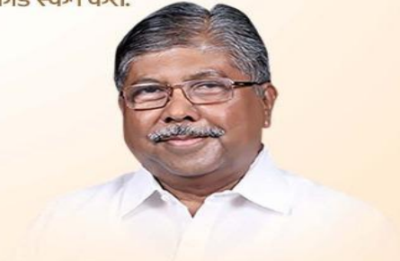
श्री. चंद्रकांतदादा पाटील मा. उच्च व तंत्रशिक्षण मंत्री