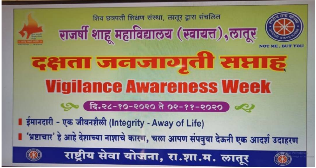
Banner of the program