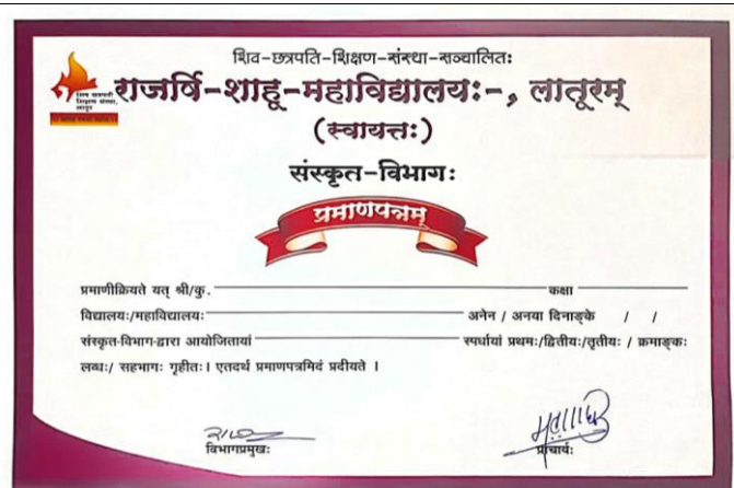
This Certificate was given to the Students.