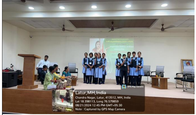
Student presenting a Sanskrit Song during the Competition.