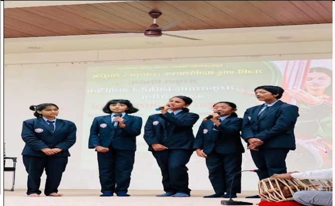
Student presenting a Sanskrit Song during the Competition.