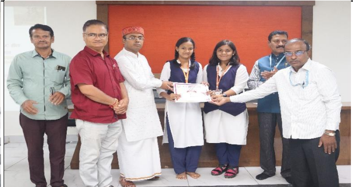
Guests distributing prizes to students in the competition.