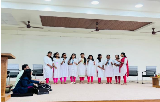
Students presenting a Sanskrit Song during the Competition.