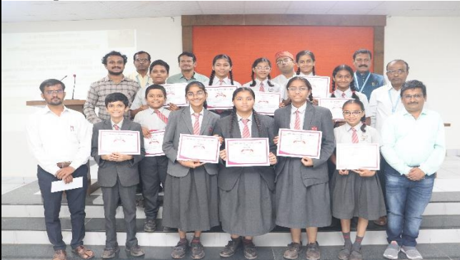
Guests distributing prizes to students in the competition.