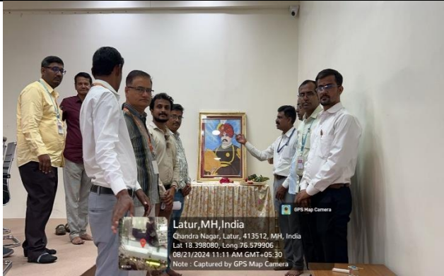
The dignitary lighting the lamp at the beginning of the competition.