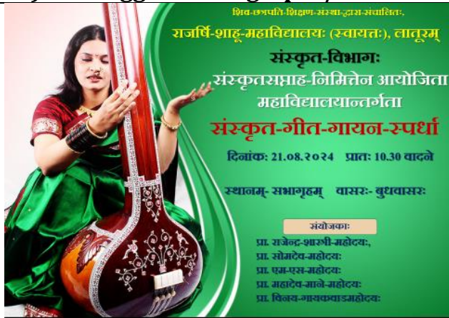
Brochure Prepared for the Programmer