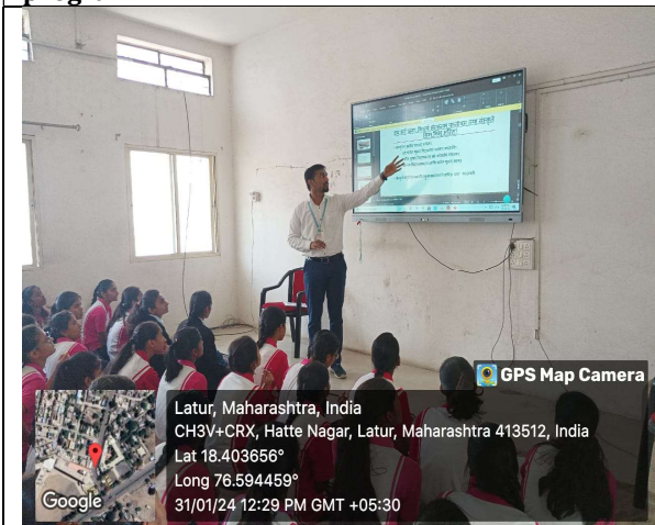
Resource Person of the program delivering the speech.