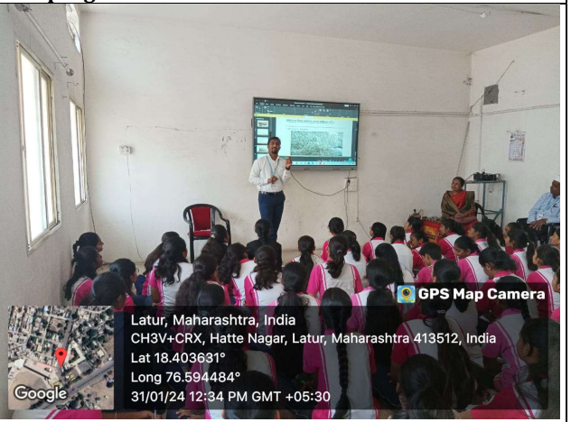
Resource Person of the program delivering the speech..