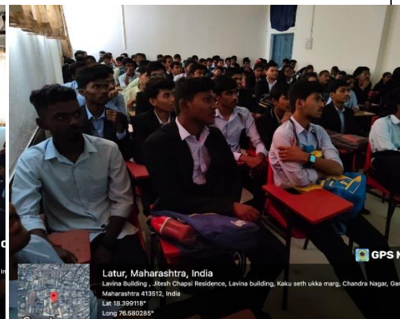
Students presence in avl