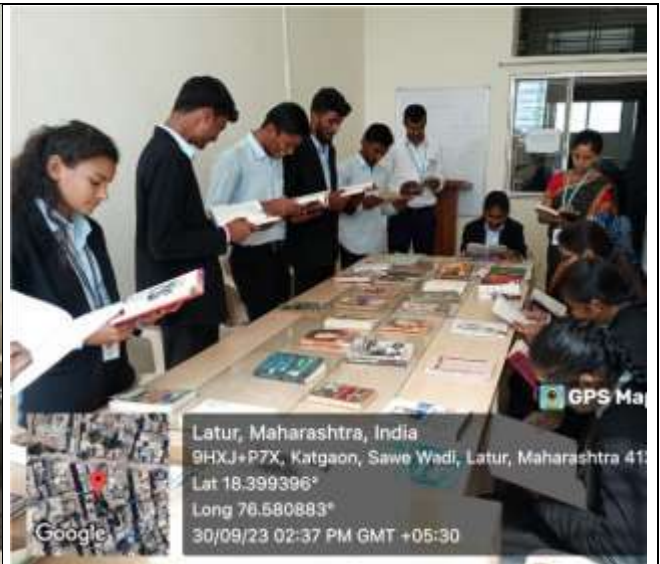
Students and staff While readingbooks.