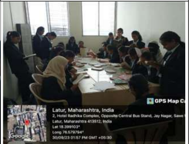
Students while enjoying reading books