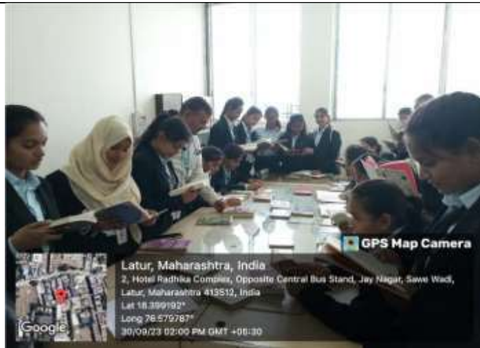
Students enjoy reading the books.