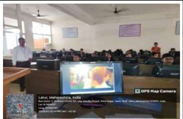
Film fest in English language lab