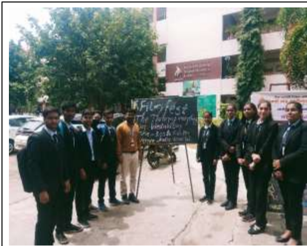
Film fest notice board and students