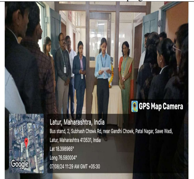
Tagore's life and literature.