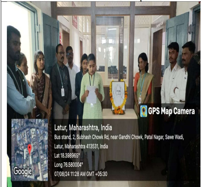
Students reflecting on