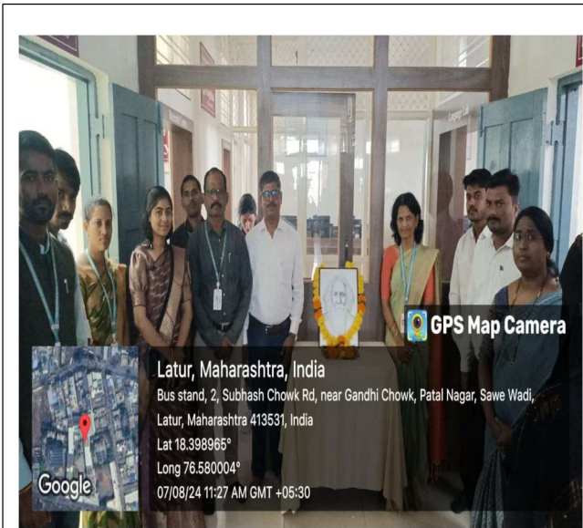
Staff offered flowers to the portrait.