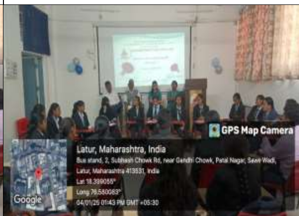
Faculty members and participated students in Group Discussion Activity