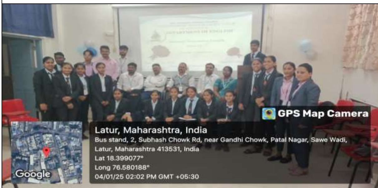
Winner Groups and Faculty members in Group Discussion Activity