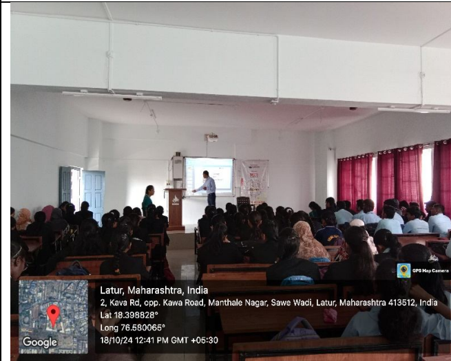
Glimpses of the program