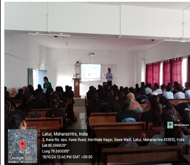
Resource Person addressing students