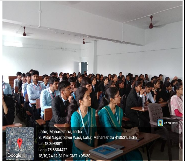
Attendees of the Programme