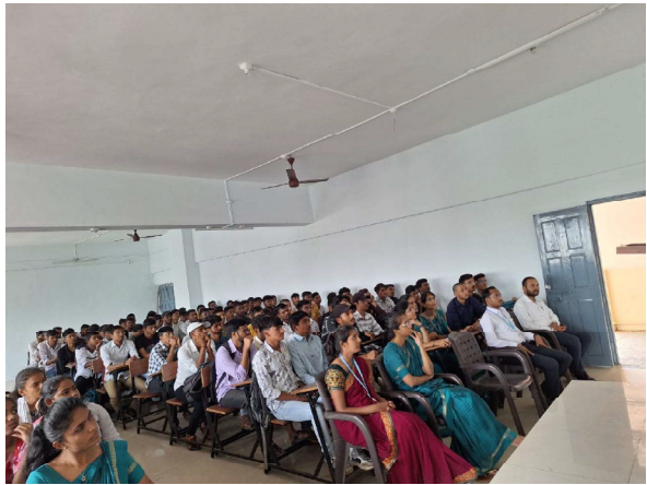
Glimpses of the Programme

D) Link of Video of the programme if any: