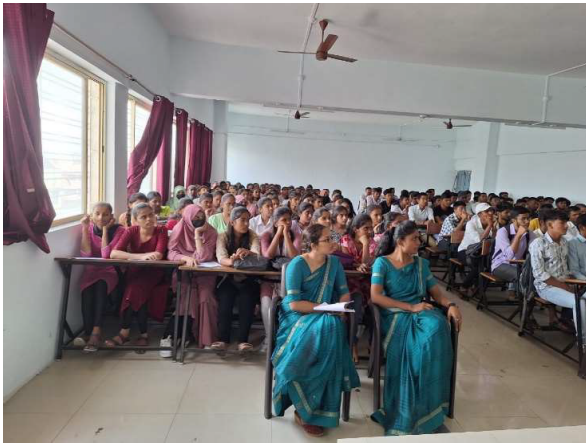
Attendees of the programme