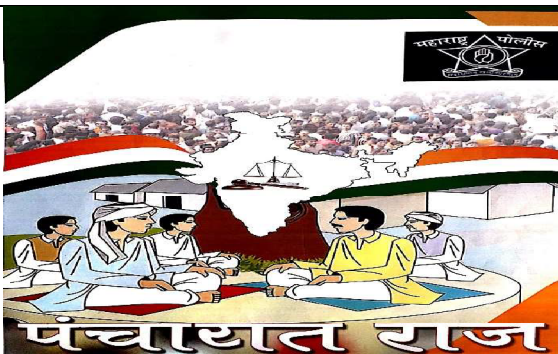
Publicity material for the programme