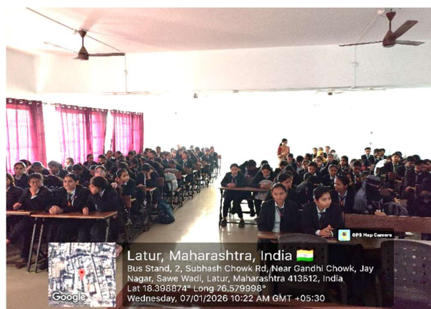
Attendees of the Programme

D) Link of Video of the programme if any: -