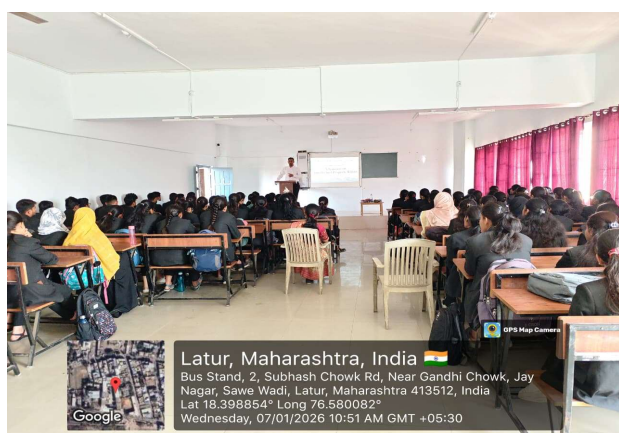
Glimpses of the Programme