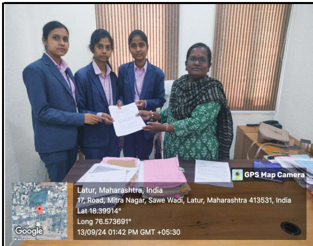
Students of Political Science with Latur city Administrative Officers