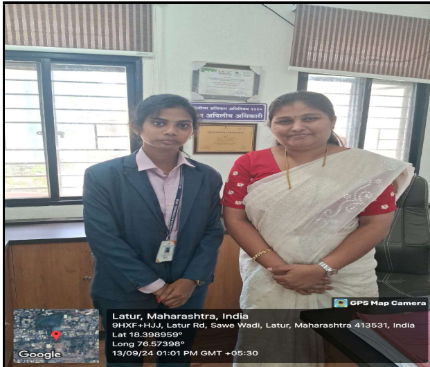
Students of Political Science with Latur city Administrative Officers