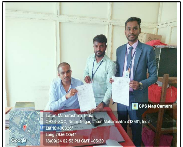
Students of Political Science with Latur city Administrative Officers