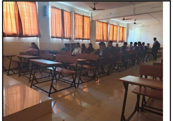
Participants watching Movie