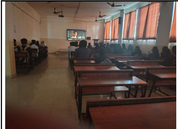
Participants watching Movie