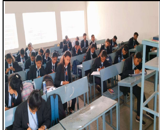
Participants in Essay writing Competition