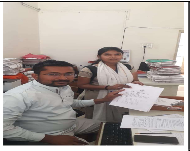
Students of Political Science with Latur city Administrative Officers