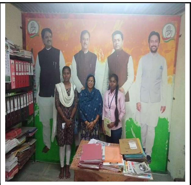
Students of Political Science with Latur city Administrative Officers