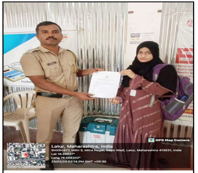
Students of Political Science with Latur city Administrative Officers