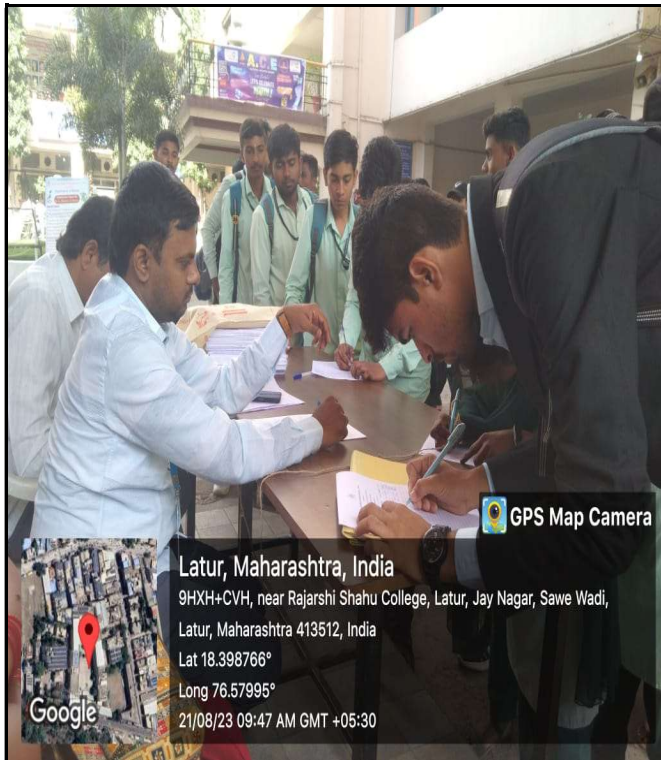
Professors and Collector office staff at registration