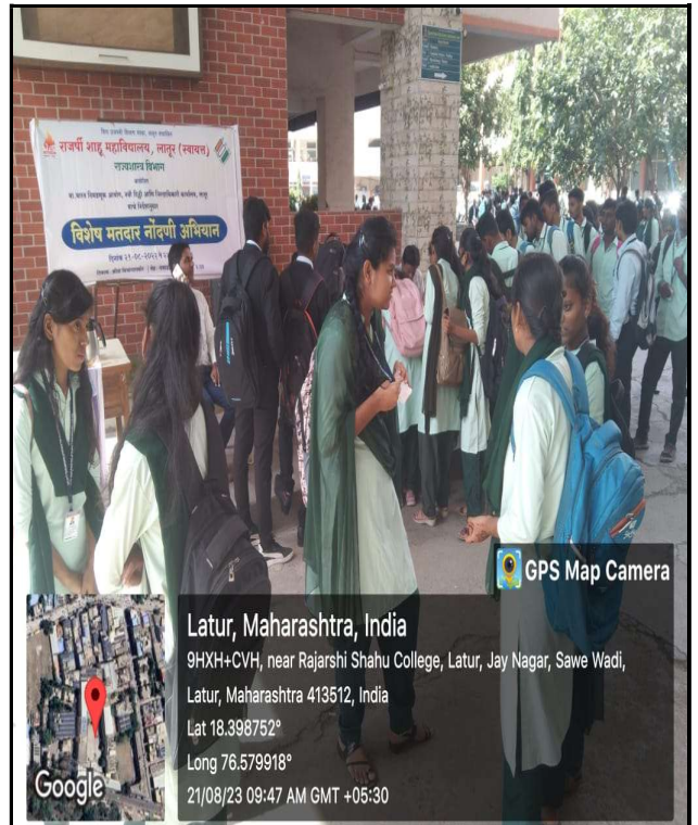
Students at Registration Booth