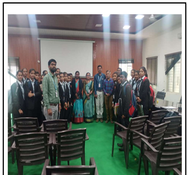
Staff ,Student and ZP officers