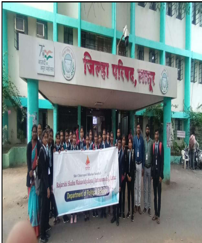
Administrative officer giving information to students