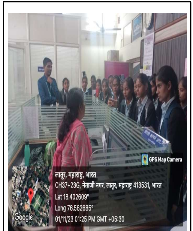
Administrative officer giving information to students