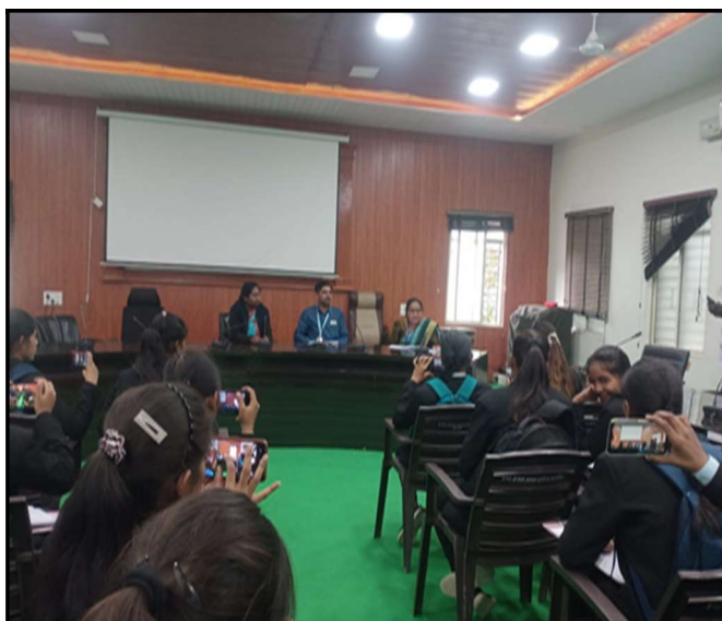
Student interacting with ZP officers