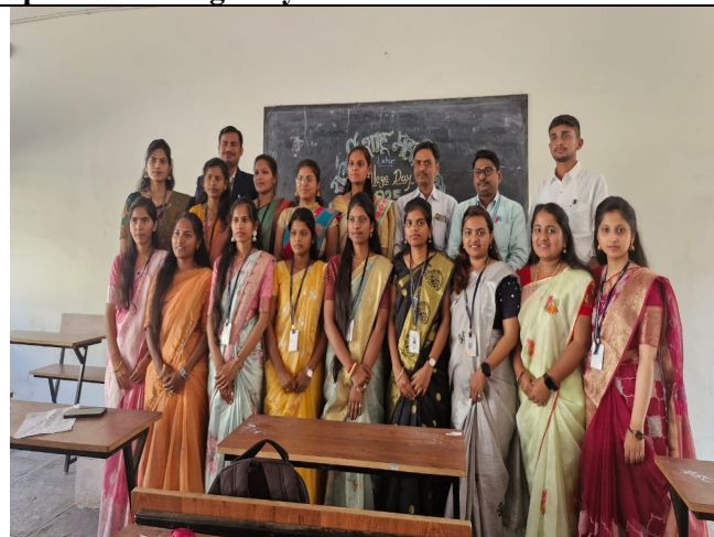
Participated student and staff member in collage day.